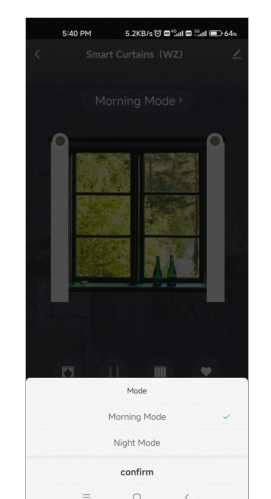
Working mode interface Morning mode: curtain on Night mode: curtain off