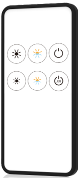
RM2 1 Zone CCT