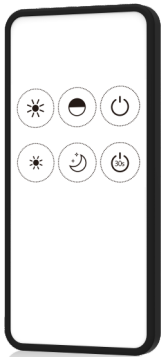
RM1 1 Zone Dimming